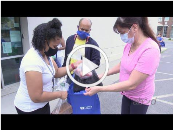
ABCD Roxbury/North Dorchester NOC is Providing Food to Those In Need