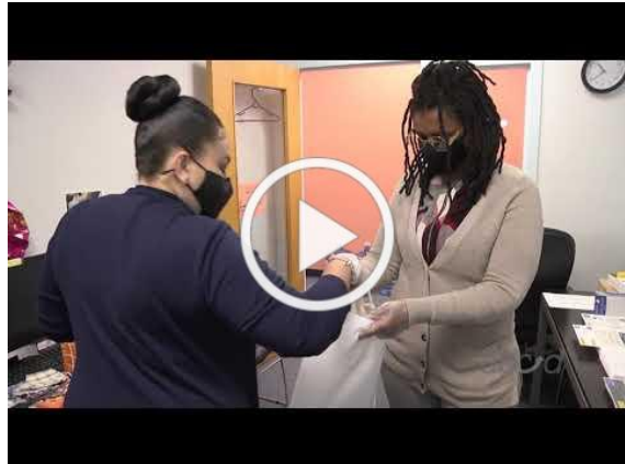
ABCD East Boston APAC Assembles Gift Bags for Seniors During COVID-19