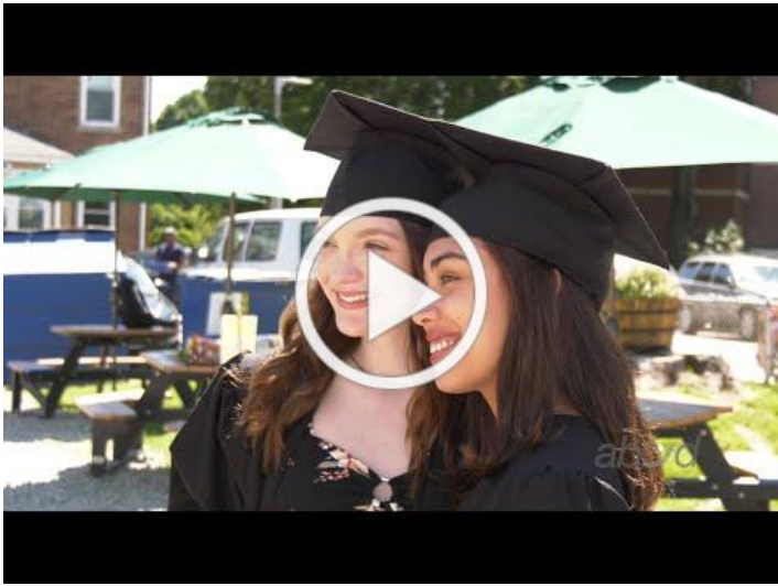
Ostiguy Recovery High School Honors its 2021 Graduates

At their graduations, students shared truly inspiring stories. Watch these video recaps to hear what they had to say on their graduation day.