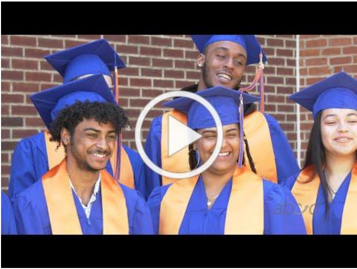
ABCD's University High School Honors its 2021 Graduates