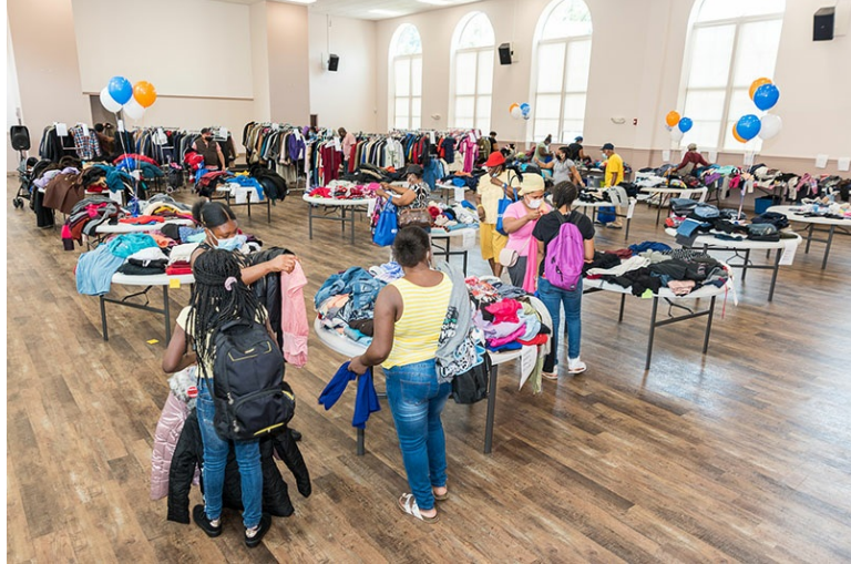
July 22 Clothing Drive - Roxbury / Dorchester