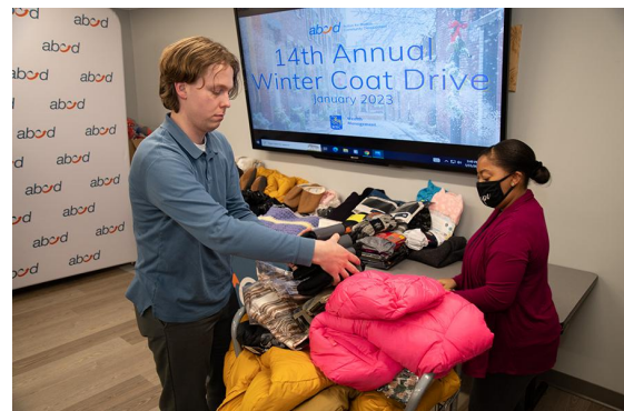
ABCD staffers loading up winter items provided by RBC Wealth Management for distribution to clients