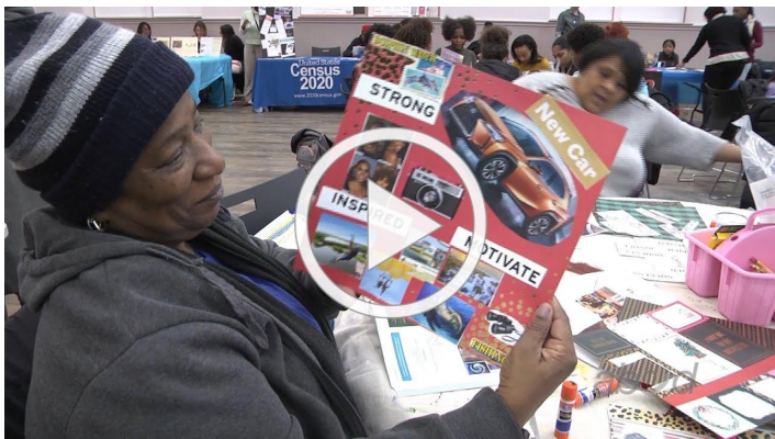
ABCD's Get StartEd Program