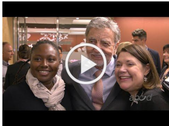
ABCD North End/West End Buona Sera 2019