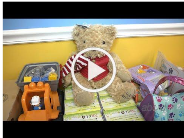
ABCD Receives Holiday Toy Drive Donations