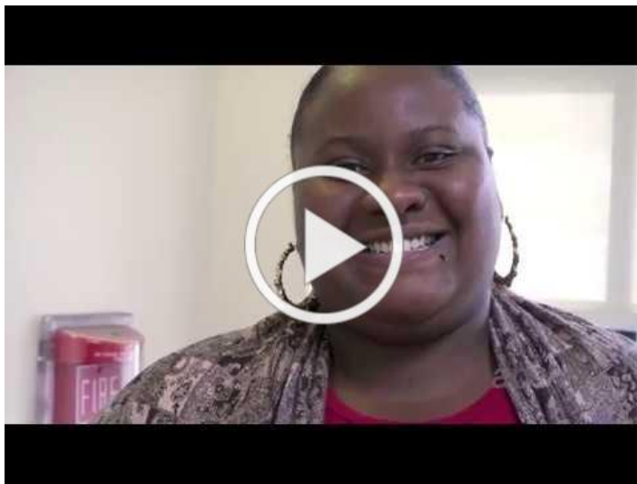
ABCD Mattapan FSC Provides Thanksgiving Turkeys