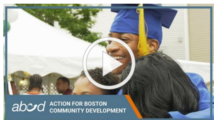
Ostiguy High Graduation 2022

Contact ABCD Connect for information about programs and services.