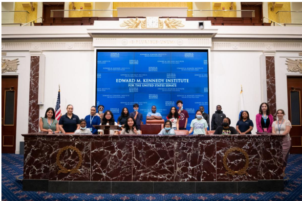
Participants in our Youth Engaged in Action (YEA!) program had the opportunity to become senators for a day at the Edward M. Kennedy Institute for the US Senate, which features the nation’s only full-scale replica of the United States Senate Chamber!