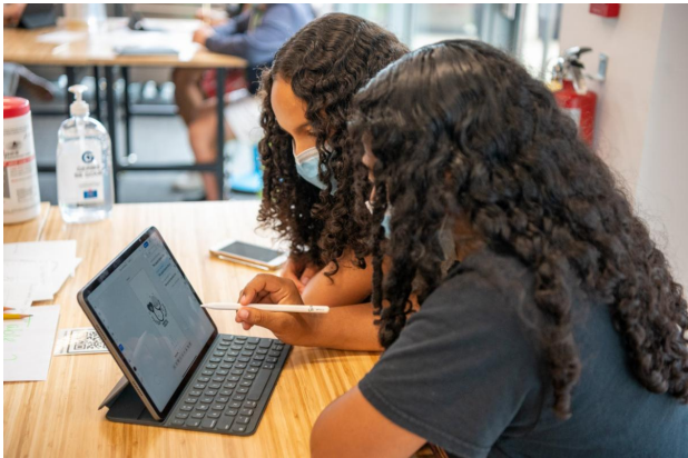
Two youth work on the digital design for their team’s mental health-related business idea.